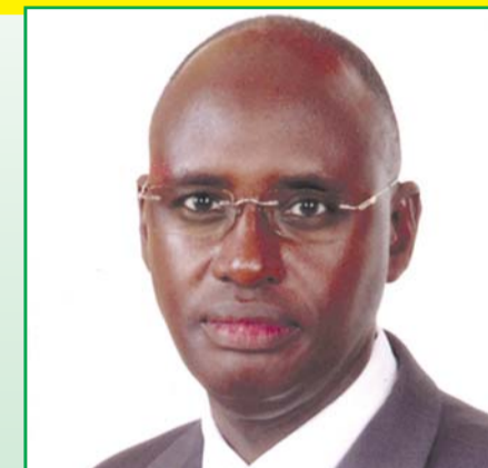
Hon. Lt. Col. Bright K. Rwamirama