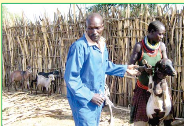
Vaccination of goats and sheep against PPR in Karamoja