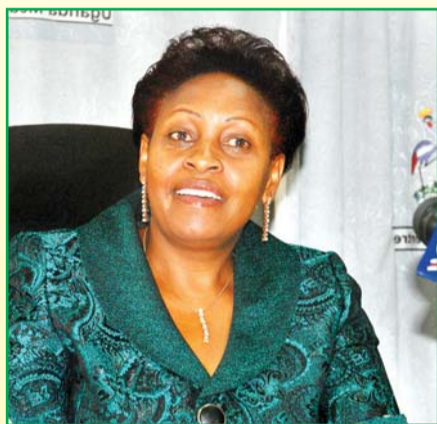
Hon. Hope Ruhindi Mwesigye

Minister of Agriculture Animal Industry and Fisheries